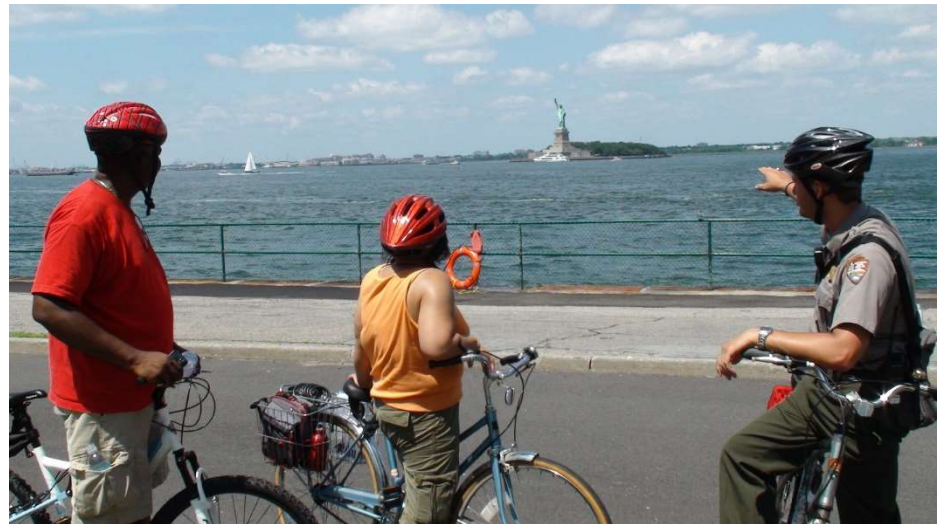
Governors Island National Monument (NPS)