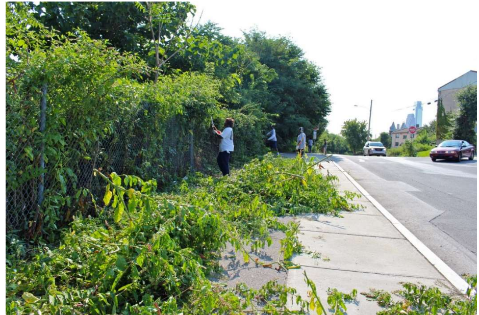
Mantua Greenway, Philadelphia