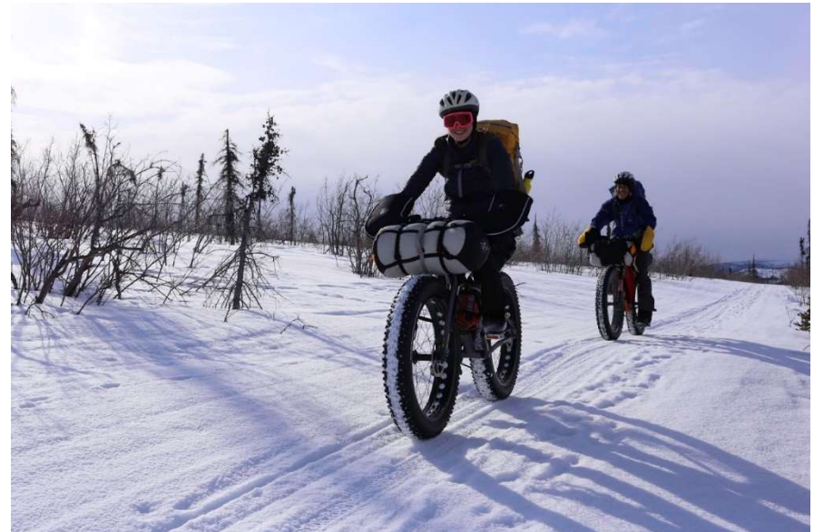
Boreal Forest, Alaska (Volpe Center)