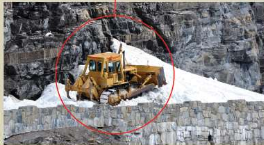
Clearing the road at Haystack Creek near Bird Woman Falls Overlook