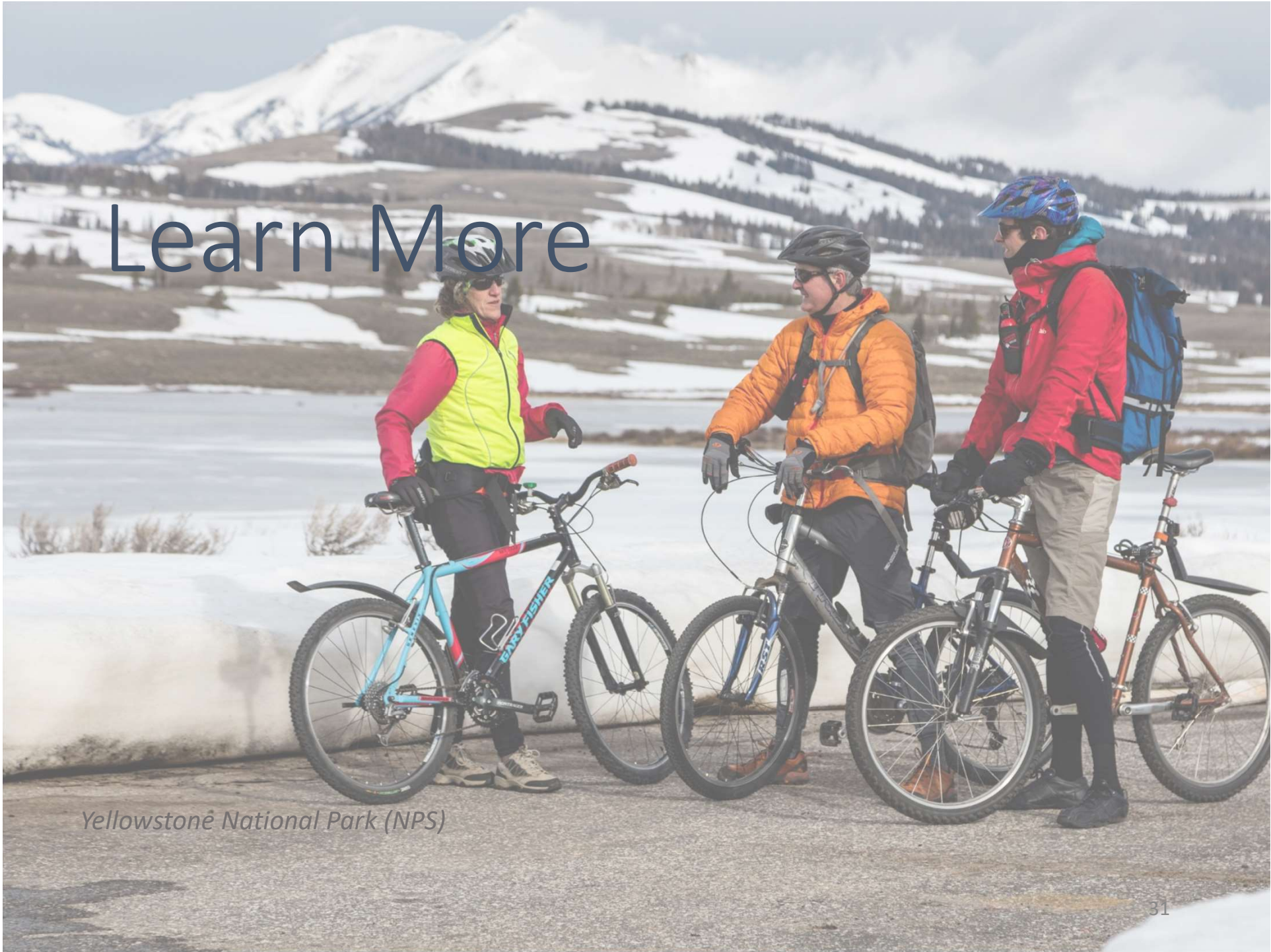
Yellowstone National Park (NPS)