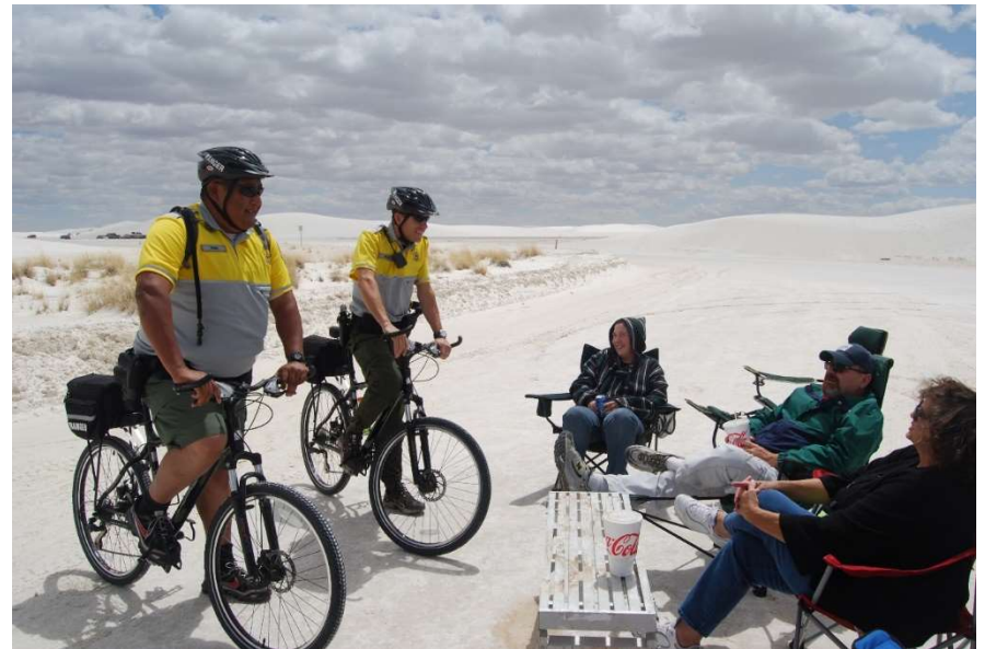
White Sands National Monument (NPS)