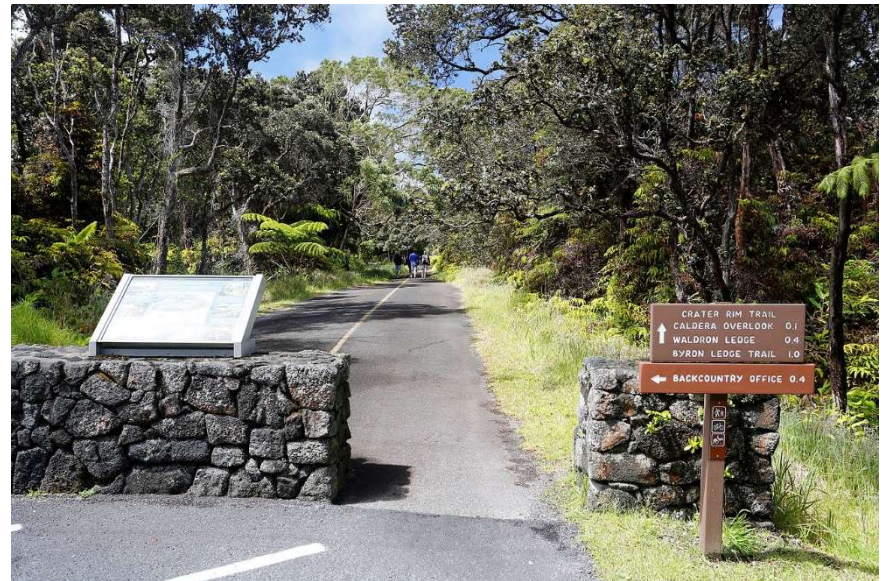
Crater Lake National Park (NPS)