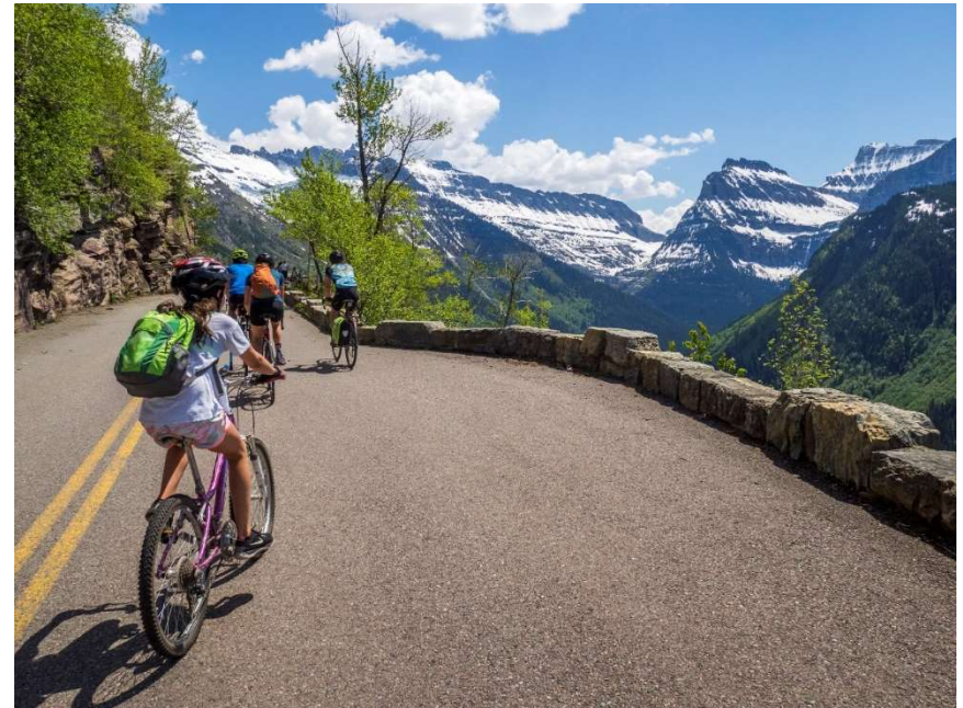
Glacier National Park (S. Snow)