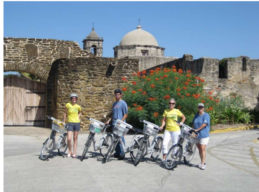
San Antonio Missions National Historical Park