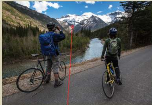
Bikers along McDonald Creek have an excellent view of the upper section of the Going-to-the-Sun Road.

Bring bear spray. Bears may be encountered all along the Going-to-the-Sun Road.