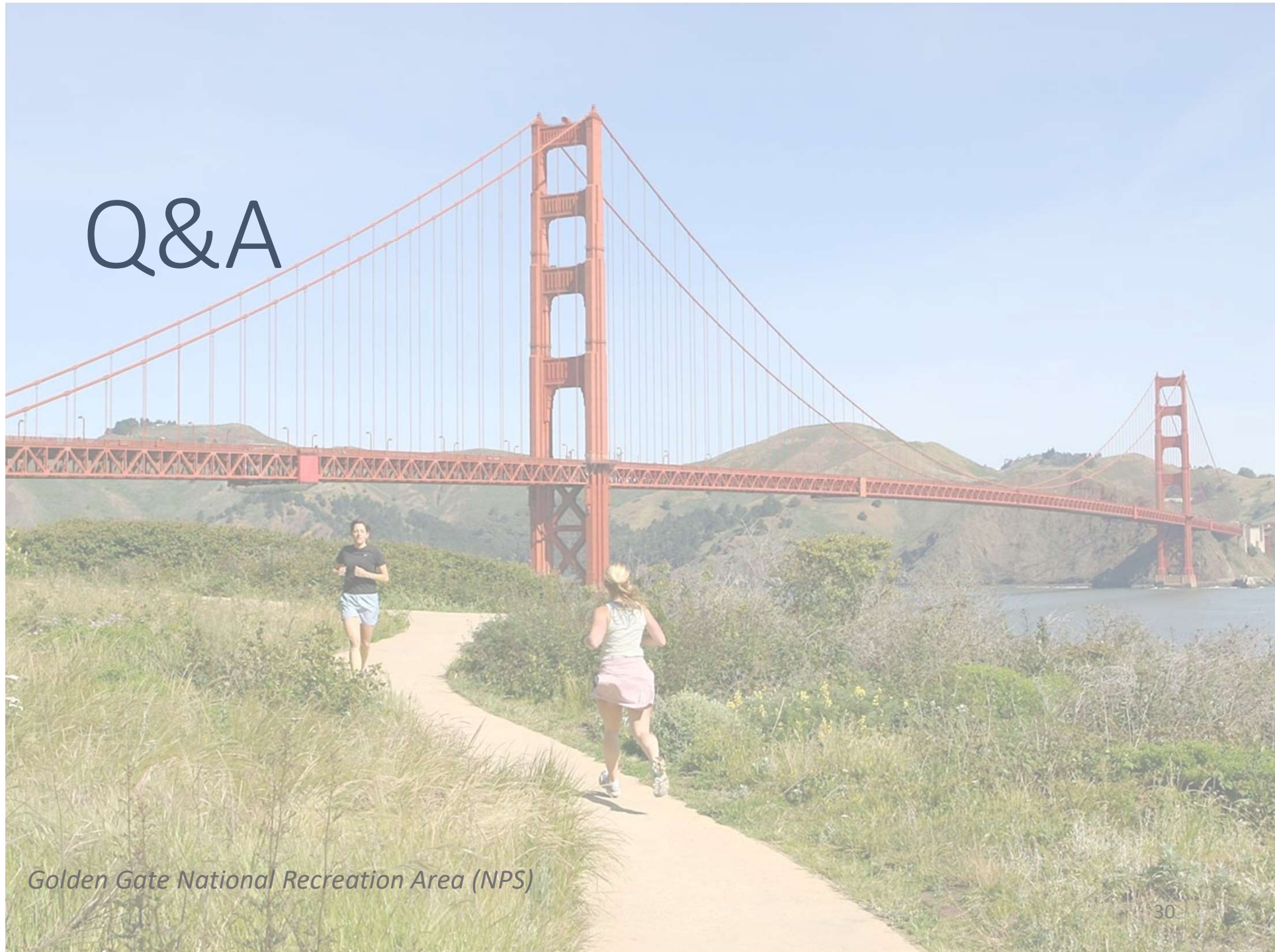
Golden Gate National Recreation Area (NPS)