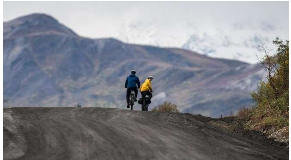
Denali National Park (NPS)