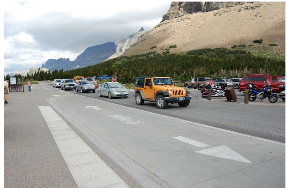
Glacier National Park (Volpe Center)